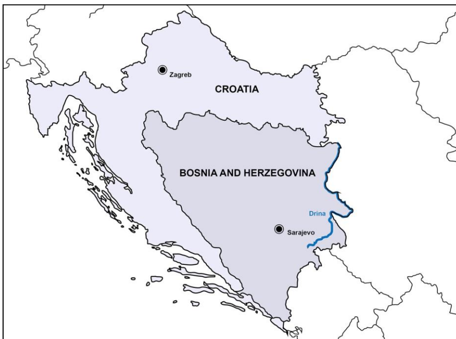
Map: The dream of a Greater Croatia – where would the borders be? (Map by ESI)

In Canada, Tudjman also met Gojko Susak, a small entrepreneur living in Toronto who was born in a Croat-majority region in Bosnia and Herzegovina. 35 Susak and Tudjman shared the belief that Croatia had a historical right to territories beyond its republican borders. For radical émigrés like Susak, Croatia proper extended to the river Drina in the East of Bosnia, as it had during the Second World War. Tudjman stated openly in 1989 that Croatia’s “historic and natural borders” exceeded those of contemporary (socialist) Croatia. 36 When the Croatian parliament adopted a new constitution, on 22 December 1990, Tudjman told the parliamentarians that Croatia “has many reasons to be dissatisfied with the existing borders.” 37 His closest aides explained later that Tudjman considered Croatia’s border with neighbouring Bosnia and Herzegovina, where some 760,000 ethnic Croats lived in 1991, “historically absurd.” 38 In September 1991, after Tudjman made Gojko Susak his minister of defence, he was in a position to support those Croats who tried to carve out their own Croatian statelet in Bosnia and Herzegovina by force.