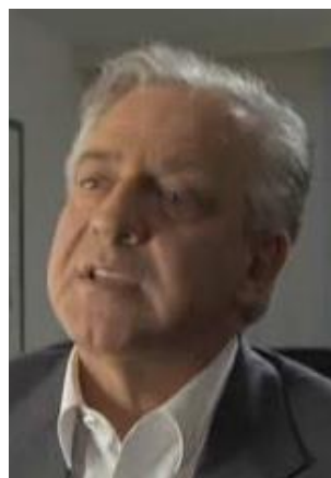
Ivo Sanader (2003-2009)