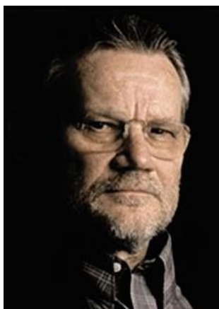
Ivica Racan (2000-2003)