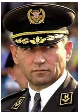
Ante Gotovina (acquitted 2012)