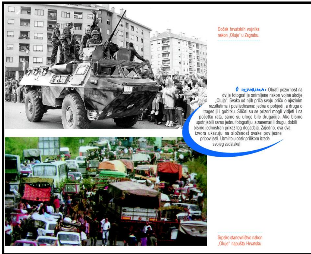
Welcome of Croatian soldiers after “Operation Storm” in Zagreb The Serbian population leaves Croatia after “Operation Storm”

The supplement triggered a fierce debate. More than 60 articles appeared, as historians, journalists and other commentators expressed their outrage. They attacked it for “distortion of the historical truth about the Serb aggression.” 86 The criticism was so harsh that the ministry of education requested additional reviews. In the end, the ministry agreed with Serb representatives to use Koren’s already available 8 th -grade textbook. The supplement was shelved.