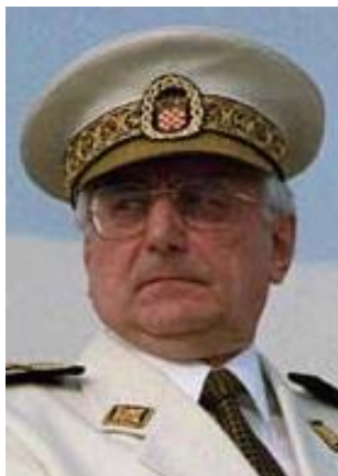
Franjo Tudjman (1990-1999)