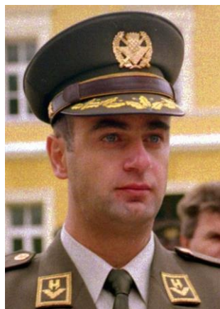
Mirko Norac (sentenced 2003 & 2008)