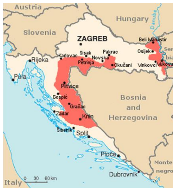
Map of Croatia showing territories occupied by Serb separatists (1991-1995): Krajina (area south of Karlovac down to Knin), Western Slavonia (between Pakrac and Okučani) and Eastern Slavonia (around Vukovar).

If the beginning of the war in Croatia took Europe by surprise, so did its end. In spring and summer of 1995, Croatia's army carried out two military operations – “Flash” and “Storm” – reconquering most Serb-held territory. The operations lasted for a mere three and four days, respectively. Nearly all Serbs residing in these areas – as many as 200,000 – fled the country. 41 In late August 1995, Tudjman came to Knin, the self-proclaimed capital of rebel Serbs in the previous four years. There he declared that Croatian Serbs “disappeared from Knin and these lands as if they had never been here ... They did not even have the time to collect their dirty money, hard currency and underwear.” 42