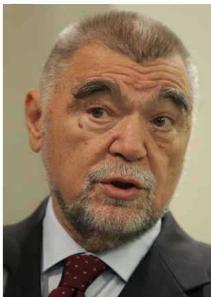
Stipe Mesic (2000-2010)