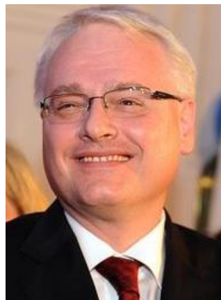
Ivo Josipovic (2010-2015)