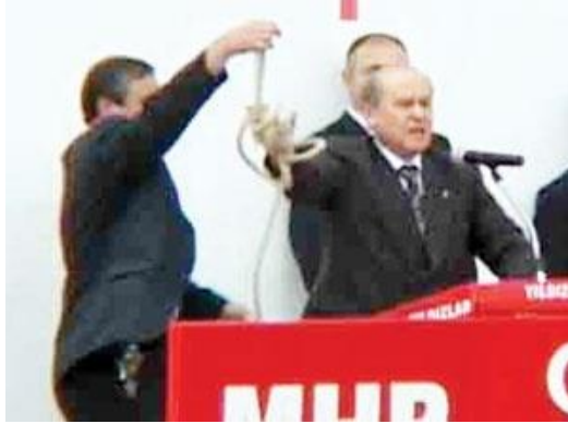
Party leader Devlet Bahçeli – most consistent defender of capital punishment