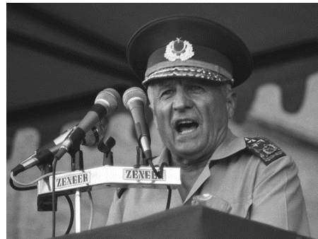
General Kenan Evren – coup leader and president in favour of executions in 1980s