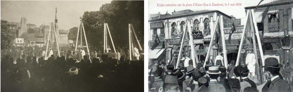
Public hangings on Sultanahmet Square and Eminonu Square

Public executions were also practised in Turkey for much longer than elsewhere in Europe. In France the last public executions occurred in 1939, when a criminal was publicly guillotined near the Palais de Justice. In 1957 there was still a public hanging in Sultanahmet Square, next to Hagia Sophia Museum. 16 It was not until 1960 that Turkey carried out its last public execution, in Istanbul's Eminonu Square. Afterwards the body remained on display for five hours. 17