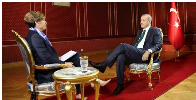
President Erdogan talking about reintroducing the death penalty in 2016