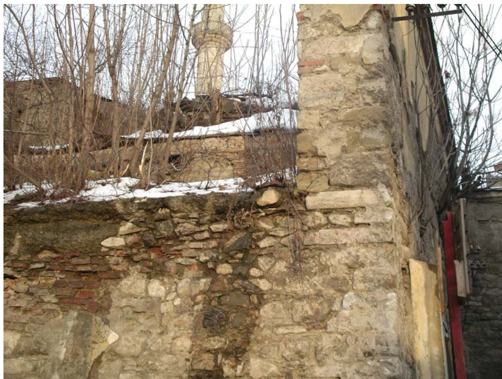
The western wall of the Great Hamam in Prishtina – ingrown trees highlight years of neglect

The 1977 law is not discriminatory – even though it does not comply with today’s European criteria on preserving cultural heritage. This law is not a law from the Milosevic era. No new law on the protection of cultural heritage has been passed until now to replace it. This means that for the last six years this was and remains the applicable legislation.