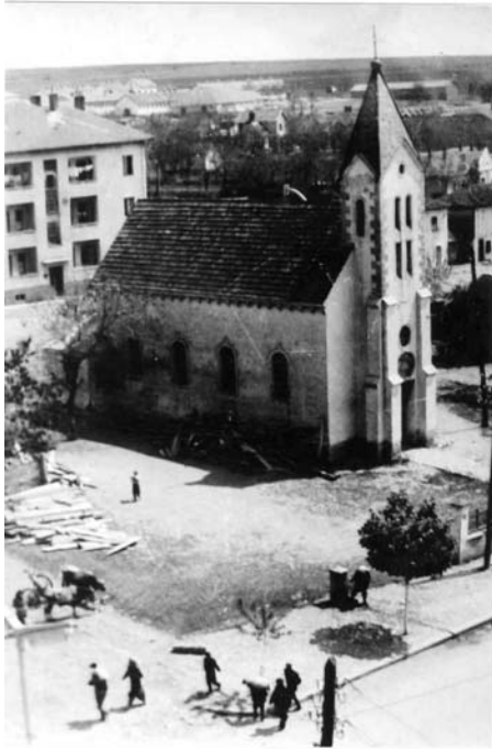
◀Catholic Church (opposite Grand Hotel, today a shopping center)