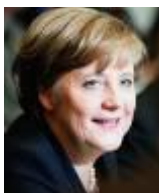
Angela Merkel (CDU) Federal Chancellor

The German government was formed in October 2009 as a coalition of the CDU, CSU and the FDP. The CDU puts up the chancellor (Angela Merkel for the second time), 7 ministers, and 18 state secretaries. The CSU has 3 ministers, 4 state secretaries. The FDP has 5 ministers (including the vice chancellor) and 8 state secretaries.