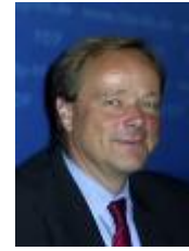
Dirk Niebel (FDP) Federal Minister for Economic Cooperation and Development