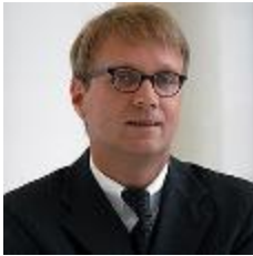
Ronald Pofalla (CDU) Federal Minister for Special Purposes and Head of the Chancellery