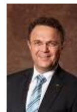
Hans-Peter Friedrich (CSU) Federal Minister of the Interior