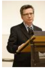
Thomas de Maizière (CDU) Federal Minister of Defence