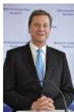
Guido Westerwelle (FDP) Vice Chancellor and Federal Foreign Minister