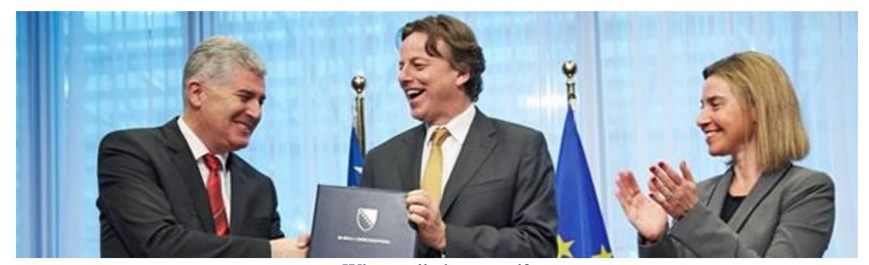
What really happened? Handing over Bosnia's EU membership application

Following the Council's decision, the European Commission will present a long list of detailed questions related to all segments of EU accession to the Bosnian government. This is the best possible test of the credibility of Bosnia's commitment. It will also test the ability of Bosnian institutions to cooperate. The ceremony in Brussels put the ball of Bosnia's European progress in the EU court. The sooner the ball is returned to Bosnian leaders, the better for the country, the EU and the credibility of the enlargement process as both strict and fair.