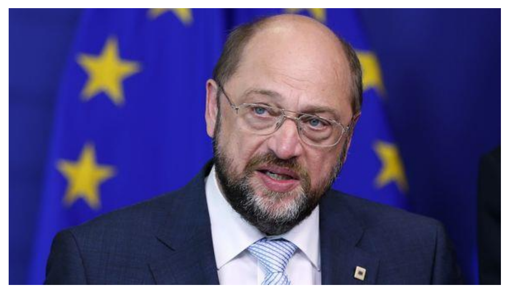
Needed: a robust strategy for human rights in accession states